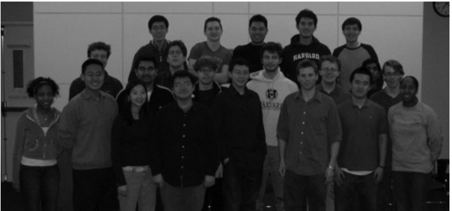
HSPDS team photo, 2006

We hope to continue our fundraising over the course of the next year, kicking off this round with the 25th alumni anniversary event in November. We also hope to announce the formation of an alumni organization at that event.